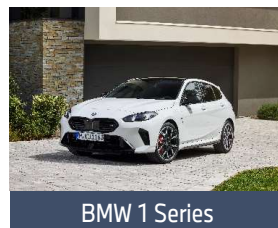
BMW 1 Series