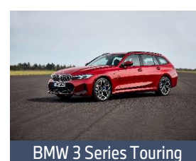
BMW 3 Series Touring