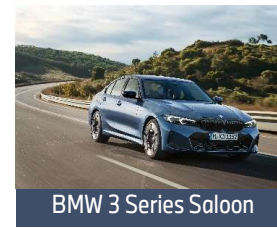
BMW 3 Series Saloon