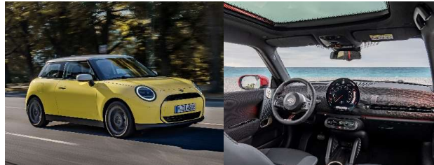
MINI COOPER ELECTRIC