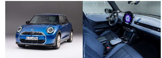
MINI COOPER 5-DOOR